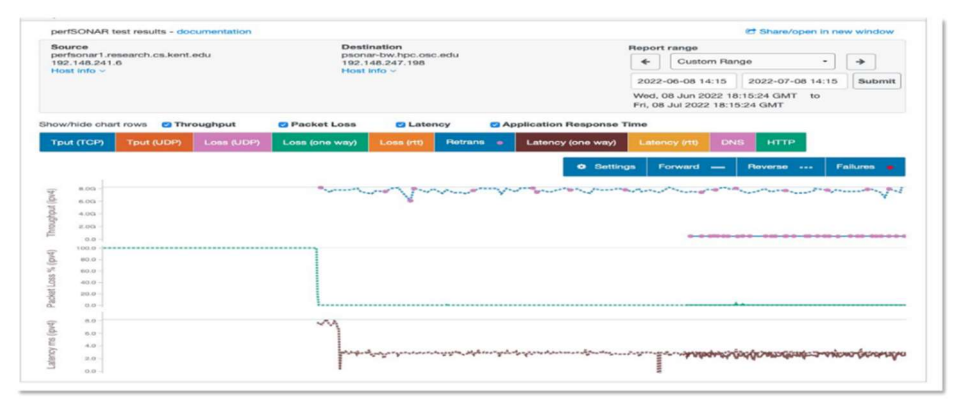
Fig. 10. PerfSONAR Results DTN Network to Ohio Super Computer