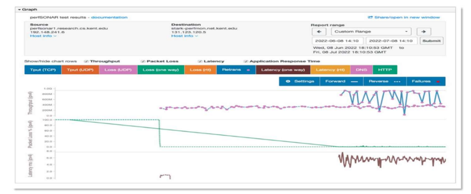
Fig. 8. PerfSONAR Results DTN Network to Kent State Stark Regional