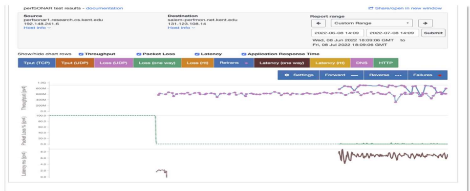
Fig. 7. PerfSONAR Results DTN Network to Kent State Salem Regional