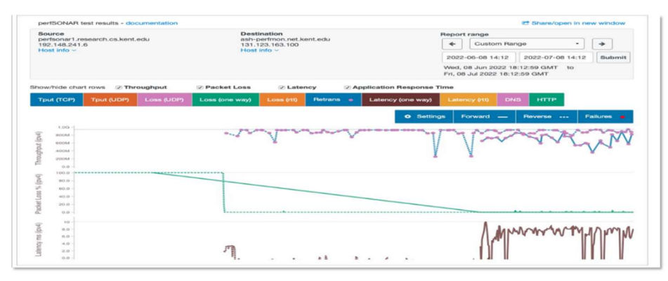
Fig. 9. PerfSONAR Results DTN Network to Kent State Ashtabula