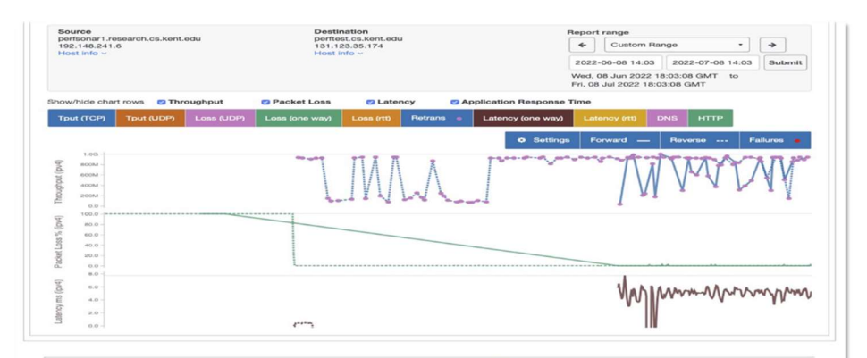
Fig. 6. Perfsonar Results DTN Network to Kent State Main Campus